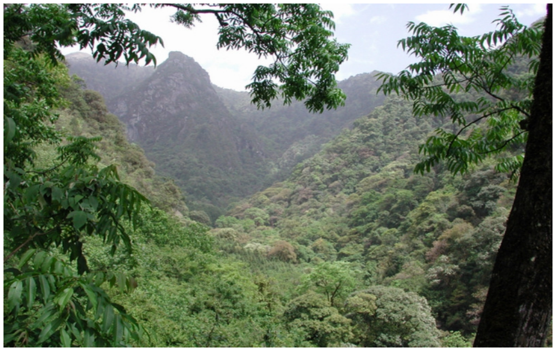
Wuliang Shan (CN251) has a distinct vertical zonation of habitats and the subtropical forests there support rare bird species such as Green Peafowl Pavo muticus , and also Black-crested Gibbon Hylobates concolor .

Key: ● = Protected; ○ = Partially protected; ○ = Unprotected.