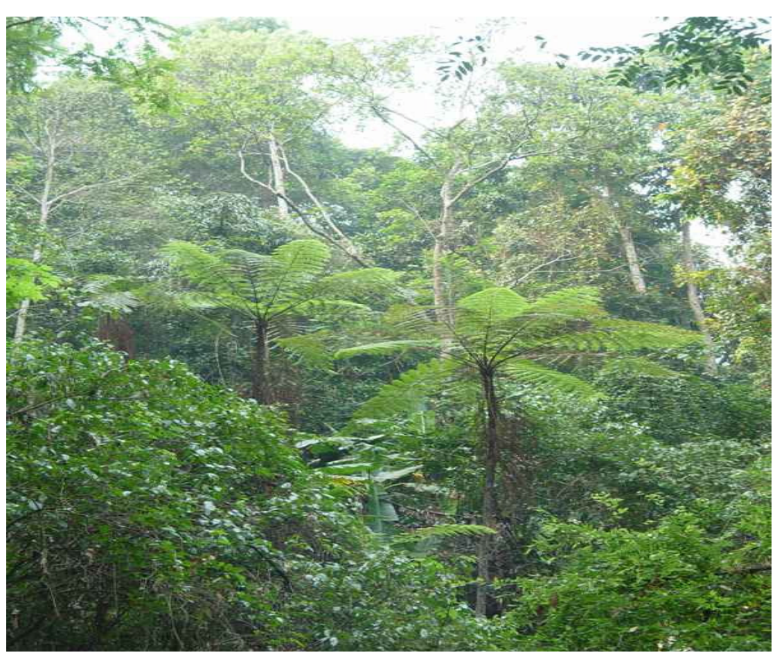
Xishuangbanna (CN261) is a famous tropical forest area in Yunnan, which supports similar biodiversity to that of South-East Asia.

IMPORTANCE TO OTHER FAUNA AND FLORA: Nationally protected plants include Parashorea chinensis, Cycas siamensis and Alsophila spinulosa. Animals include Panthera tigris corbetti , Panthera pardus, Neofelis nebulosa, Hylobates leucogenys, Presbytis phayrei, Nycticebus coucang, Bos gaurus and Elephas maximus.