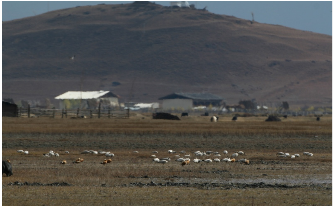
Napa Hai (CN234) is designated as a 'Wetland of International Importance' (or Ramsar site) because it is an important wintering area for Black-necked Crane Grus nigricollis and other waterbird species.

CONGREGATORY WATERBIRDS: Grus nigricollis